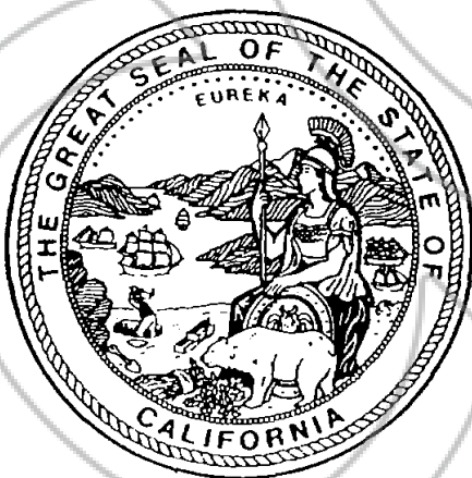
BRUCE McPHERSON Secretary of State

0207765 Book: 452 02/08/2007 Page: 120 Page 2 of 3